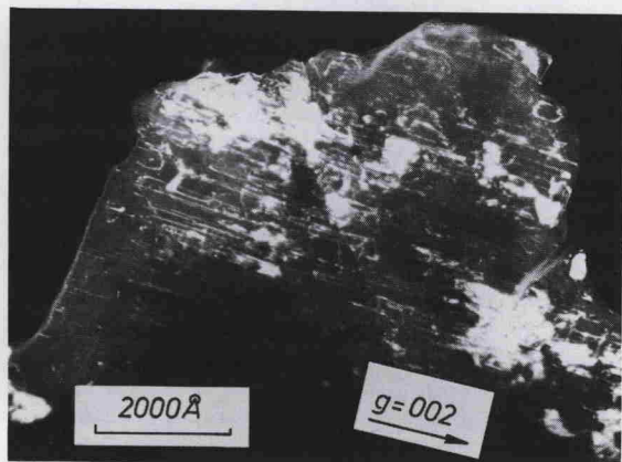
Fig. 2. Dislocations in shocked olivine from Apollo 11 (10085,26). Transmission electron micrograph. Dark field image produced by a reflection \vec{g} = 002 . Particle normal near [010]. Acceleration voltage 100 kV. (Siemens Elmicope 101.)